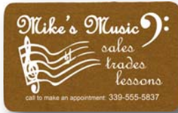
5ZR - 5 1/4" x 3 1/4" (imprint area 4 1/4" x 2 1/2")