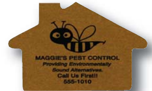
4ZHO - 5 5/8" x 3 1/2" (imprint area 3 1/2" x 1 1/4")