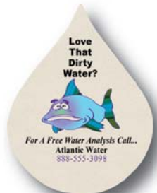
4ZFM - 3 1/2" x 4 5/8" (imprint area 2" x 2 1/4") *4-Color Process Shown