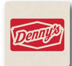
4ZSQ - 4" x 4" (imprint area 3 1/4" x 3 1/4")