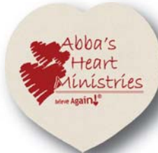
4ZHT - 4 1/4" x 4" (imprint area 3" x 2 1/4")