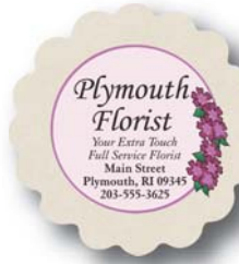
4ZFL - 4" Diameter (imprint area 2 3/4" Diameter) *4-Color Process Shown