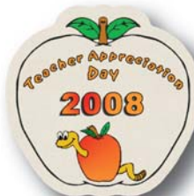
4ZAP - 4" x 4" (imprint area 2 1/4" x 2 1/4") *4-Color Process Shown