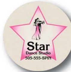
4ZC - 4" Diameter (imprint area 3 1/4" Diameter) *4-Color Process Shown