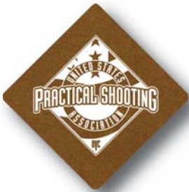
4ZD - 4" x 4" (imprint area 3 1/4" x 3 1/4")