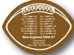
4ZFB - 4 5/8" x 3 1/2" (imprint area 3" x 1 1/4")