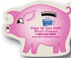
4ZPG - 4 3/8" x 3 1/4" (imprint area 1 3/4" x 1 1/4") *4-Color Process Shown