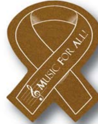
4ZRB - 3 1/2" x 4 1/2" (imprint area 5/8" x 2 3/4")